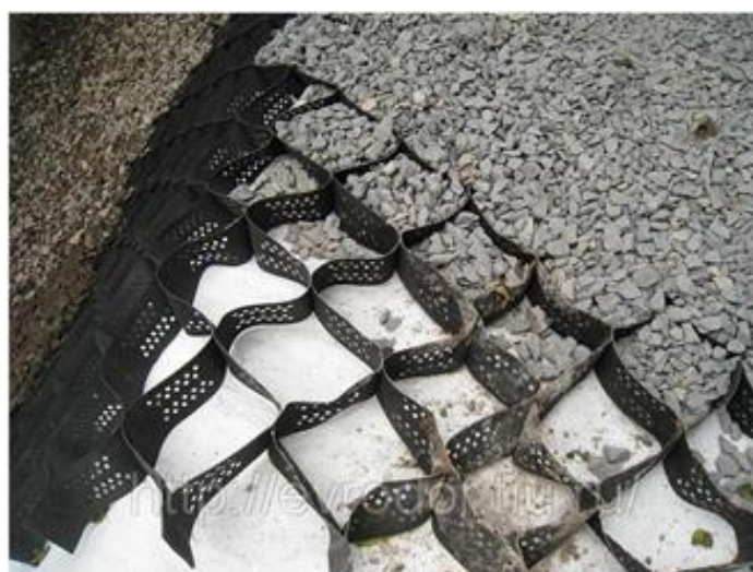
Fig. 5. Plastic geogrids of low pressure Рис. 5. Полиэтиленовая георешетка низкого давления

The fourth part of the route of the hiking trail. It starts from the first observation