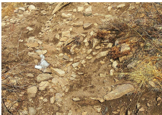
Fig. 2. The mineral part of soil of the hiking trail

The starting point of the ascent of Shara-Tebseg Mountain mostly consists of mineral parts of soil and presents rock particles of different sizes (fig. 2).