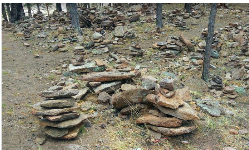
Fig. 1. «Turs» – artificial structures in the form of pyramids on the area of “Mertiskaya krepost” (“The Merkit fortress”)